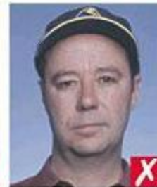
wearing a cap