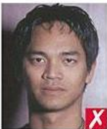
shadows behind head

- are not permitted except for religious reasons, but your facial features from bottom of chin to top of forehead and both edges of your face must be clearly shown.