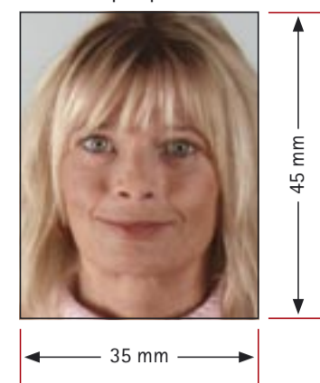
minimum size of the face