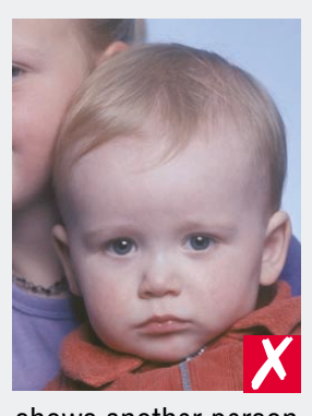
shows another person

show alone (no chair backs, toys or other people visible), looking at the camera with a neutral expression and the mouth closed.