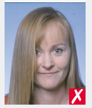
hair across eyes