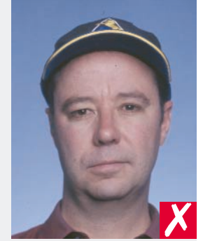
wearing a cap