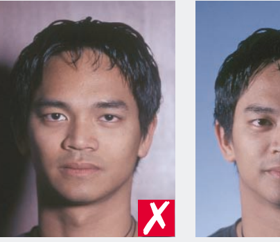
shadows behind head