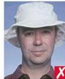
wearing a hat