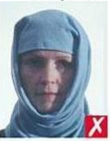
shadows across face