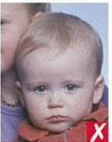
shows another person