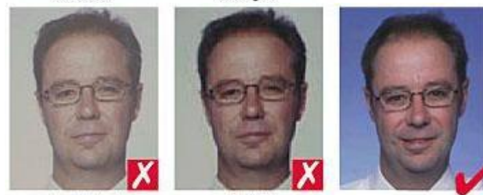
washed out colour