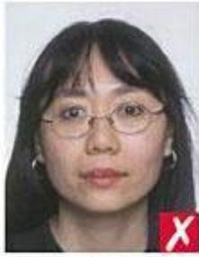
frames covering eyes