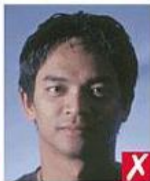
shadows across face