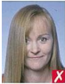
hair across eyes