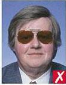
dark tinted lenses