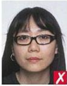
frames too heavy

- show you alone (no chair backs, toys or other people visible), looking at the camera with a neutral expression and your mouth closed.