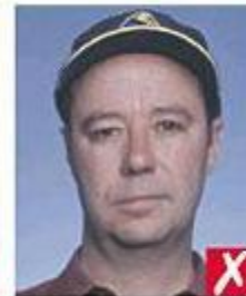
wearing a cap