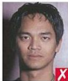
shadows behind head

- are not permitted except for religious reasons, but your facial features from bottom of chin to top of forehead and both edges of your face must be clearly shown.