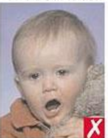
mouth open and toy too close to face