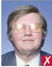
flash reflection on lenses