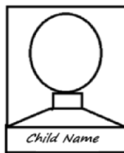
5 Years and Above