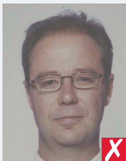
washed out colour