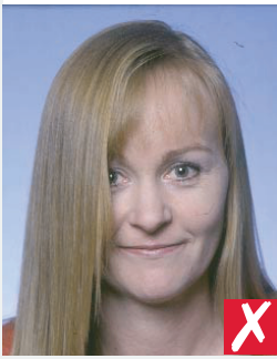
hair across eyes