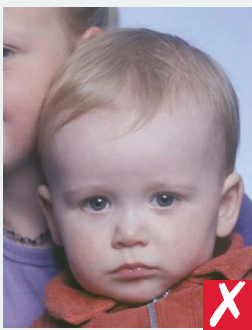
shows another person