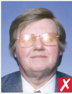
flash reflection on lenses