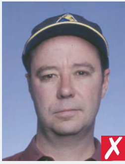
wearing a cap