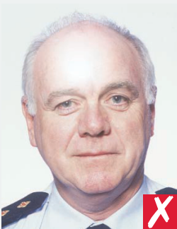
flash reflection on skin