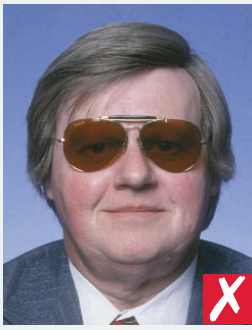
dark tinted lenses