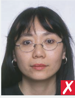
frames covering eyes