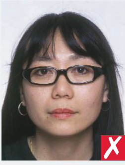
frames too heavy