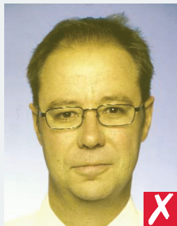
unnatural skin tones