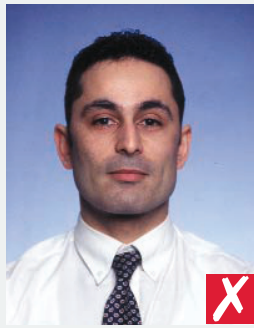
too far away