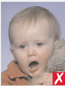
mouth open and toy too close to face