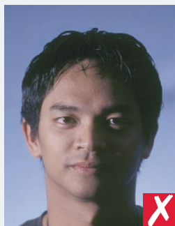
shadows across face