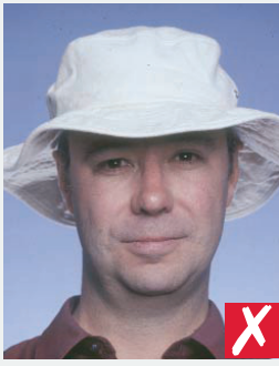
wearing a hat